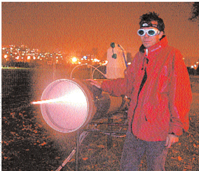
On a foggy night outside Lyon, France, when regular laser beams would be scattered, stable filaments of 400-mJ, 100-fs laser pulses are detected by a cloud chamber over a distance of 50 m.

the broader laser beam. As long as the surrounding beam had enough energy, the filament was almost unaffected by the fog